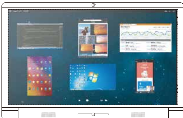
Communication connect anything