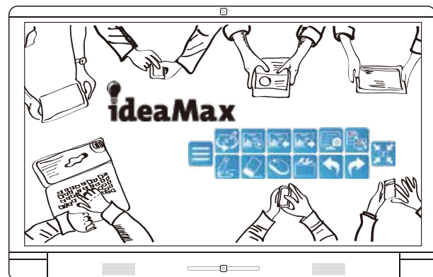
Quick access annotation & intuitive interface